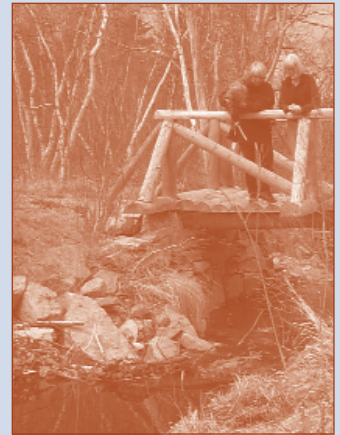
Great Meadow Loop Trail ⑮