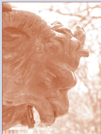
Florentine fountain at the Village Green ①