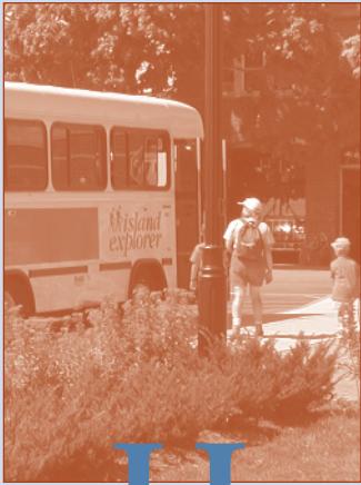
Island Explorer at the Village Green ①

This Colonial Revival-style library was completed in 1911. Step inside, browse the collection, and be sure to look up. Small in stature, it is expansive and abundant in classical architectural details and is listed on the National Register of Historic Places.