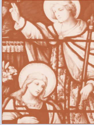
Stained-glass window at St. Saviour's ④