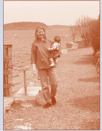
Shore Path along Frenchman Bay ⑬